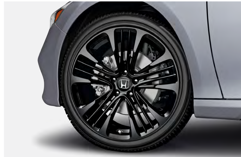
19-Inch Glint Black Alloy Wheels