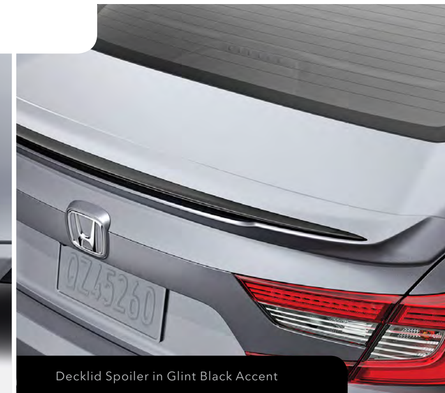
Decklid Spoiler in Glint Black Accent