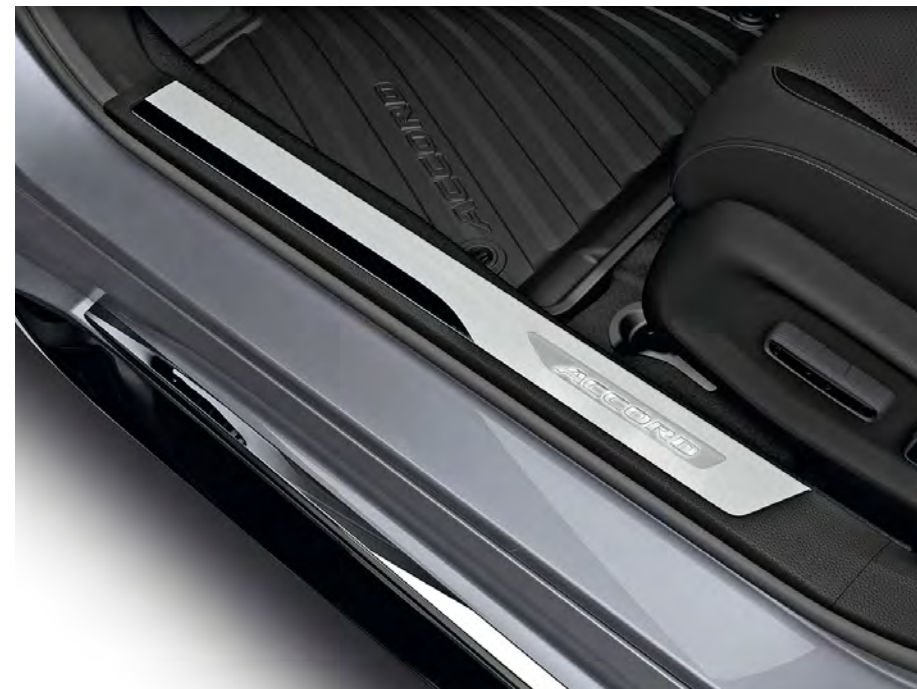
Door Sill Trim