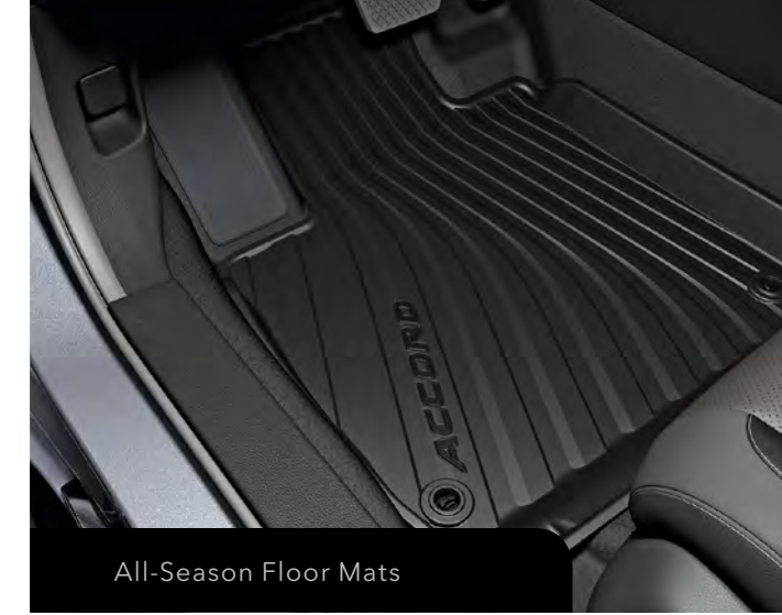
All-Season Floor Mats

Accord Touring shown in Lunar Silver Metallic with Honda Genuine Accessories.