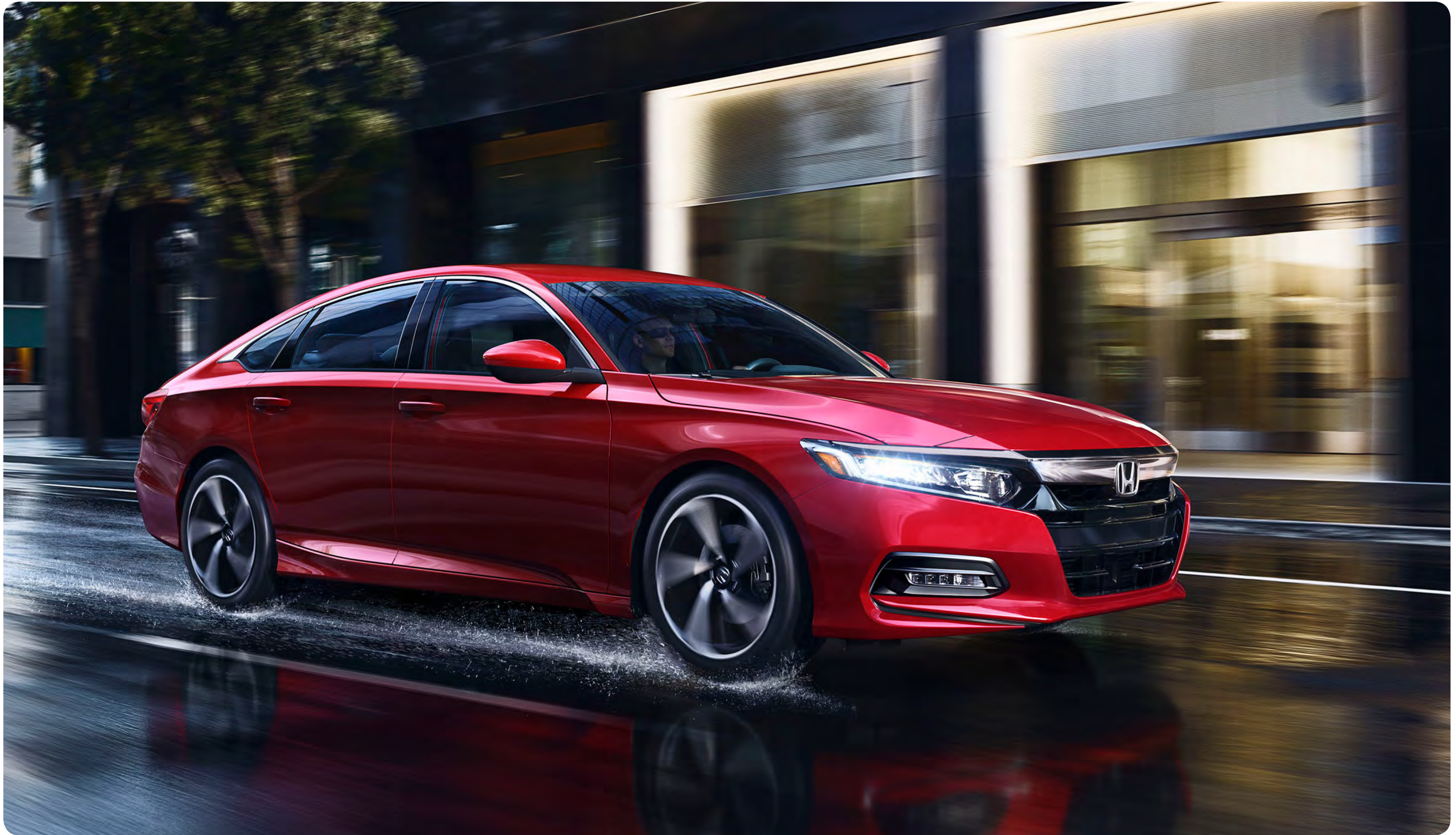
Accord Sport shown in San Marino Red.