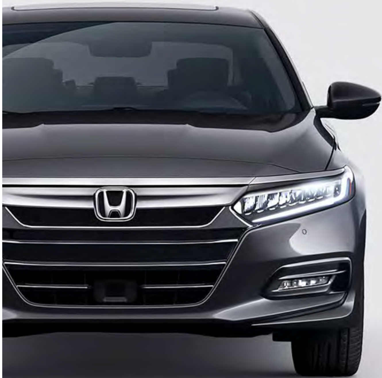
Accord Touring shown in Modern Steel Metallic.